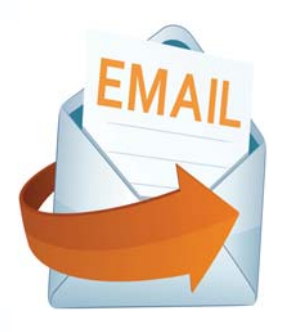
Email a description of your needs. Provide patio sqft, wall length, height & plants.