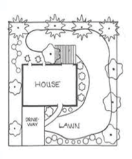
Draw a sketch including house dimensions, existing elements, L x W of site, & suggested plants.