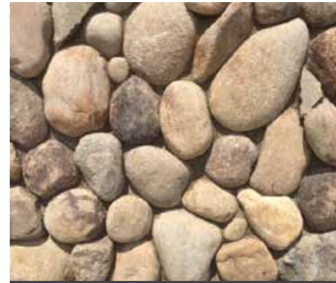
River Rounds Blend™