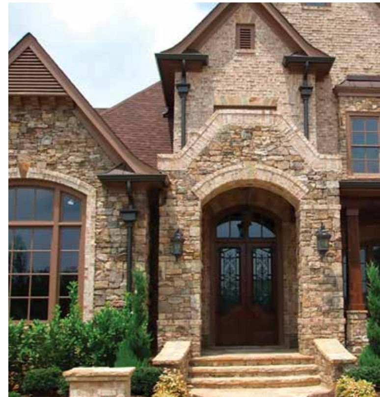
Strip Rubble Brown Thin and Medium with Smokey Mountain Ledge

An installation guide can be downloaded from our website www.realstoneveneersoftn.com