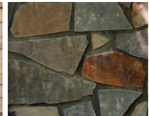
Gray Mosaic Irregular Shapes