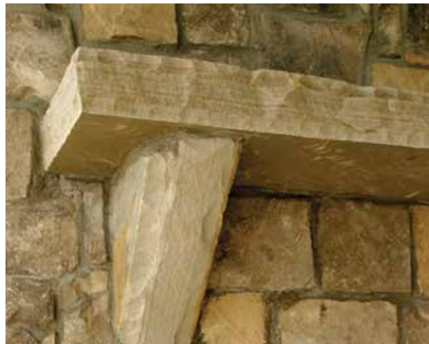
Mantels and Corbels