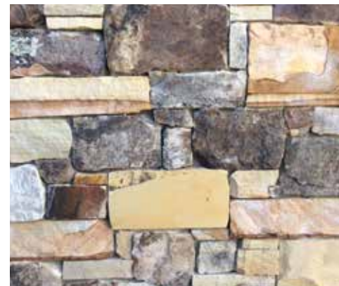
Monte Vista Blend™