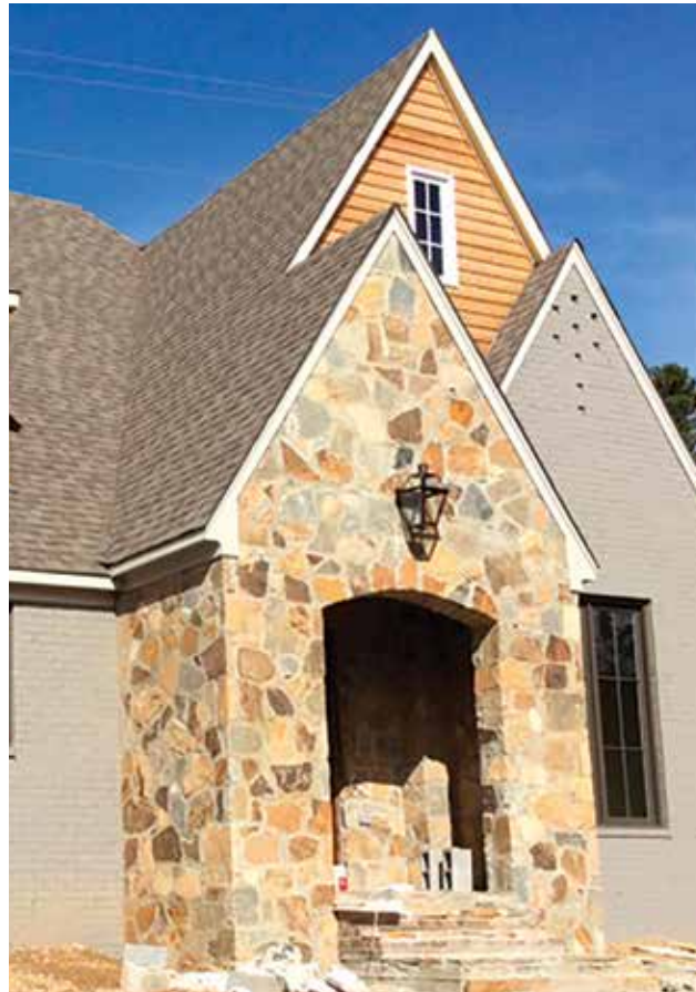
Brown & Gray Mosaic Blend