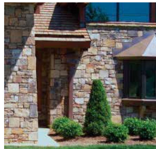
Monte Vista Blend™