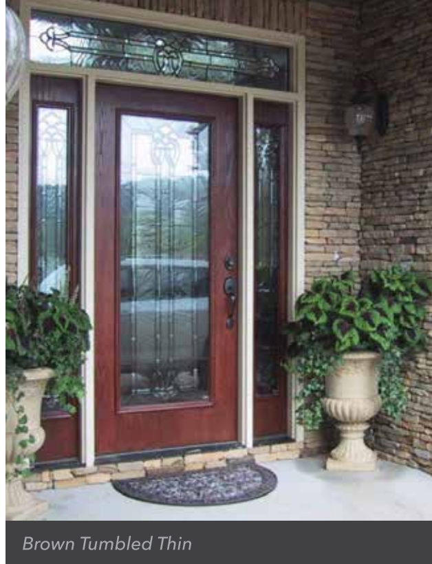
Brown Tumbled Thin