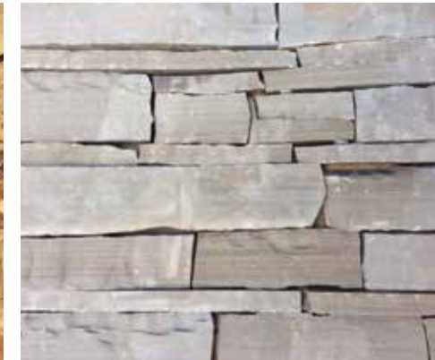
Strip Rubble Gray Random Lengths