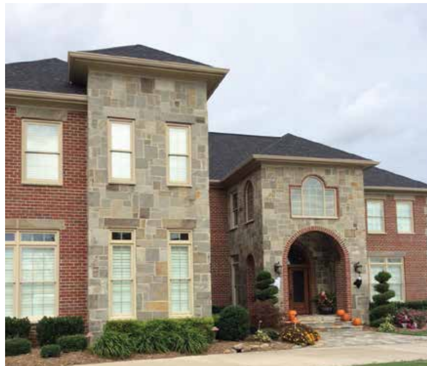
Gray Ashlar Natural Face