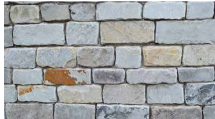
Tumbled Gray Cobblestone