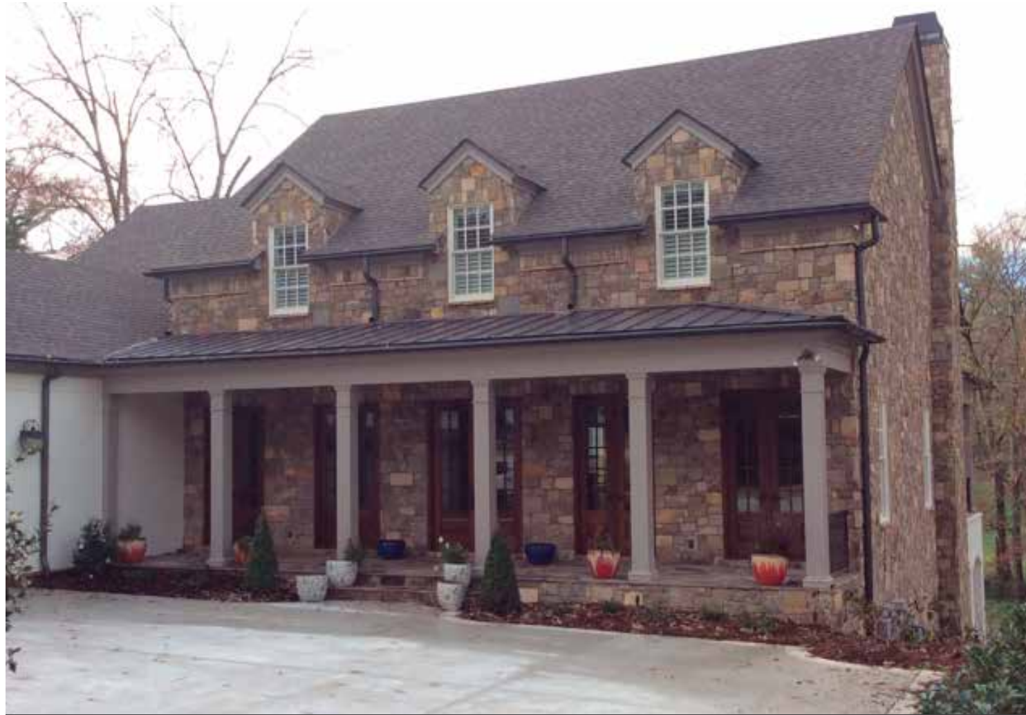
North River Blend™