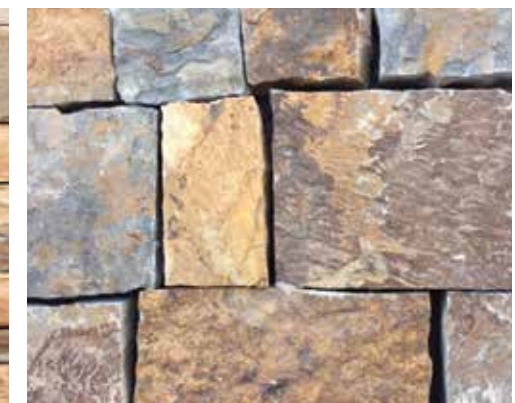
Copperhead Ashlar 6"-12" Roughly Broken Squares & Rectangles