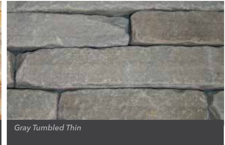
Gray Tumbled Thin