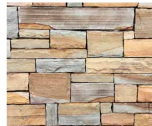
Brown & Gray Strip Rubble Blend Random Lengths