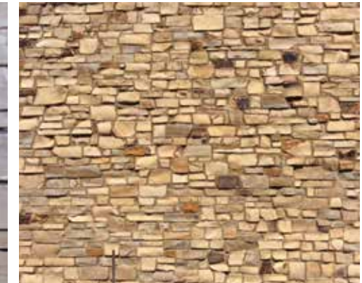
Cahaba River Random Lengths Natural, Broken & Split Face