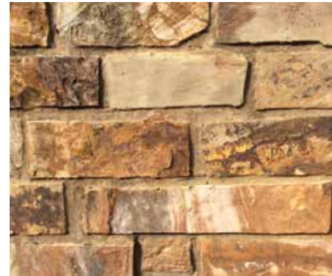
Strip Rubble Brown Natural Face Random Lengths