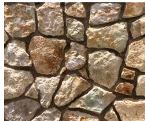
Ocala Buff Mosaic 6"-10" Natural Face Irregular Shapes