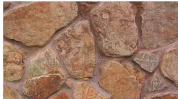
Brown Tumbled Mosaic