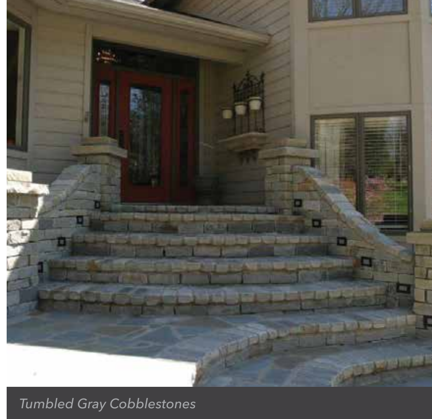
Tumbled Gray Cobblestones