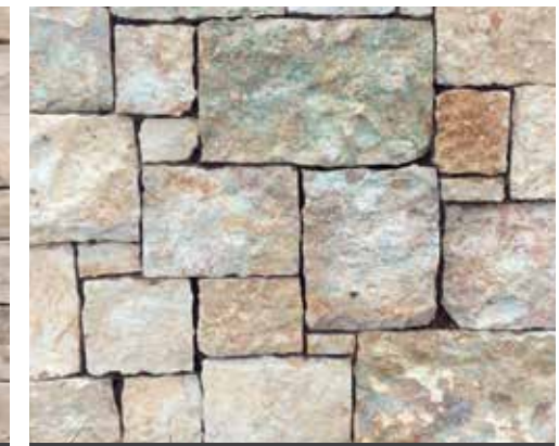
Cedar Crest Ashlar 6"-12" Roughly Broken Squares & Rectangles