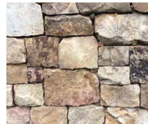
Chapel Hill Blend™