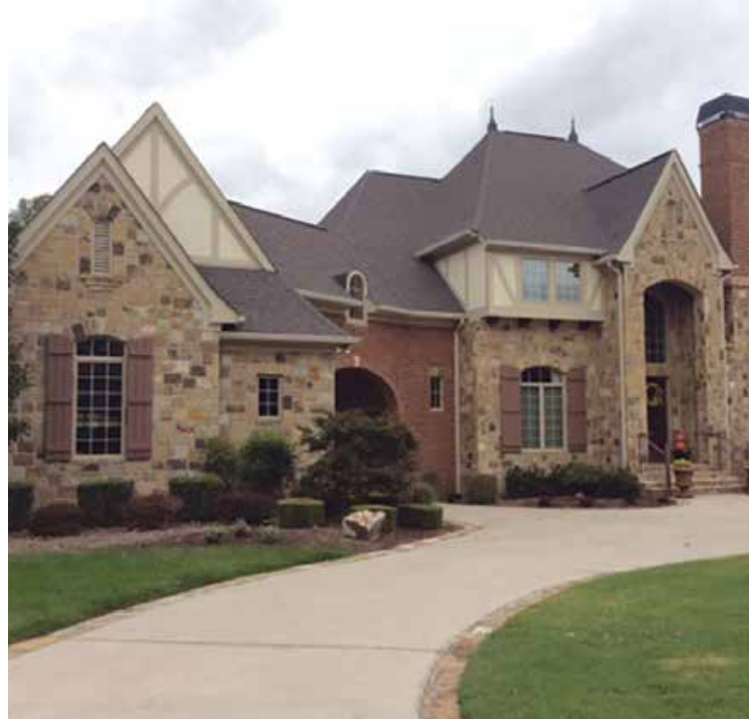
Brown Ashlar 6" - 12" Roughly Broken Squares & Rectangles