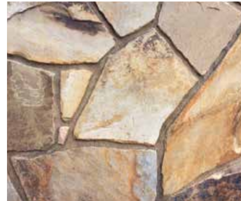
Brown Mosaic Irregular Shapes