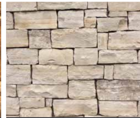
Cedar Crest Splitface Roughly Broken Random Lengths