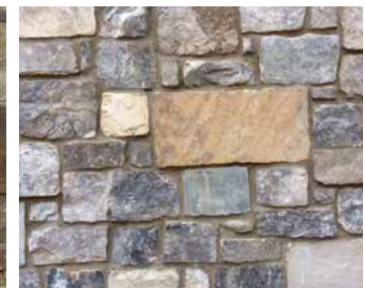
North River Blend™