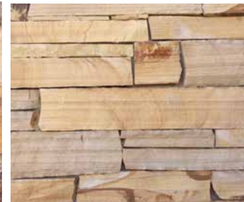
Brown Strip Rubble Random Lengths