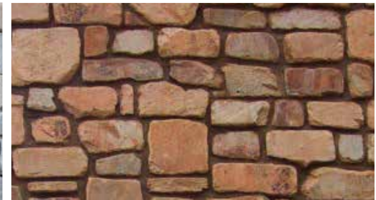
Water's Edge Brown