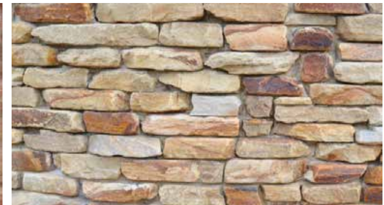
Brown Tumbled Thin