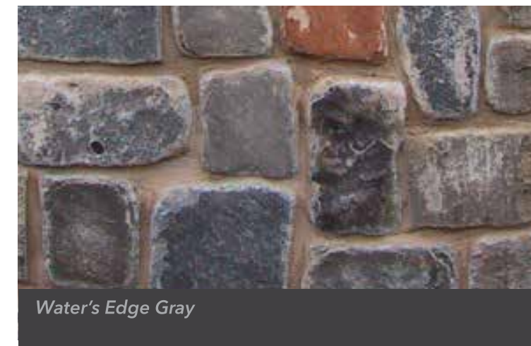
Water's Edge Gray