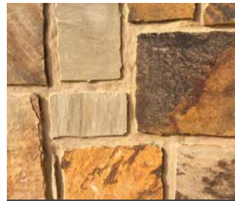
Brown Ashlar 6"-12" Roughly Broken Squares & Rectangles